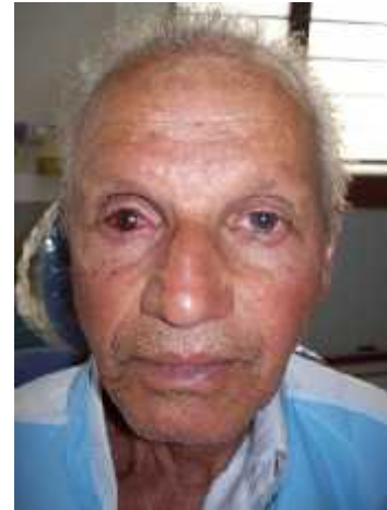
Figure 6. Try-in with iris button

method. Central placement of the iris and marking the corneal plane is done to achieve symmetry of the two eyes. Various methods have been used to achieve symmetry: