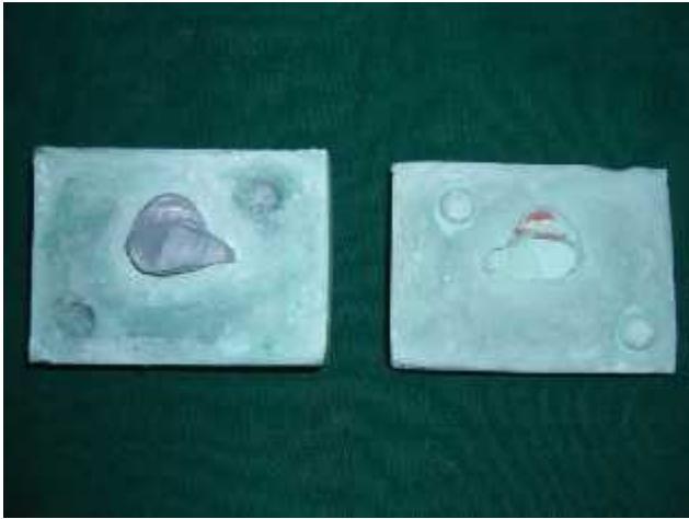
Figure 4. Stone cast

Separating media is then applied and dental stone is poured into the remaining impression. After the mold is set, two halves of the cast are separated and the impression is removed carefully.