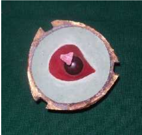
Figure 7. Wax pattern invested

The esthetic and comfort of custom-made ocular prosthesis is far better than the stock prosthesis. It is a recommended form of treatment. This procedure is simple, economical and will increase the self-confidence of the patient (Puranik et al. , 2013; Thirunavukkarasu et al. , 2014; Shrivastava et al. , 2013).