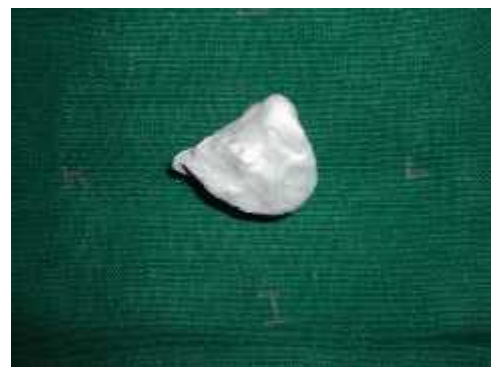
Figure 3. Tissue surface of impression