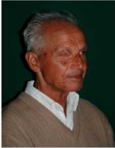
Figure 1. Patient with enucleated right eye

prosthesis, emphasizing his wish not to wear tinted glasses. It was decided to fabricate a custom acrylic ocular prosthesis to attend to all the problems of the current prosthesis. After a thorough examination of the ocular defect, the treatment was initiated.