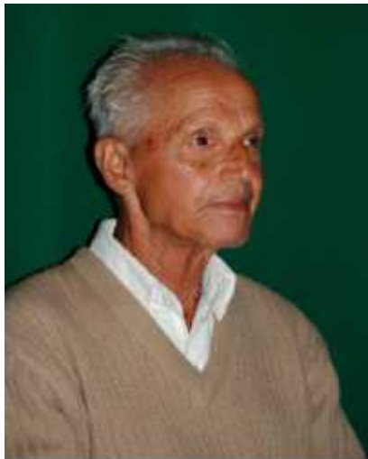
Figure 8. After treatment