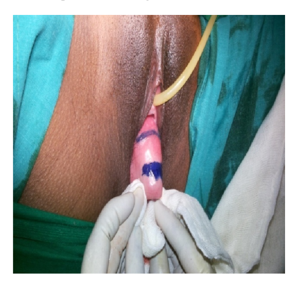
Figure B. Sleeve of cervix demarcated for excision