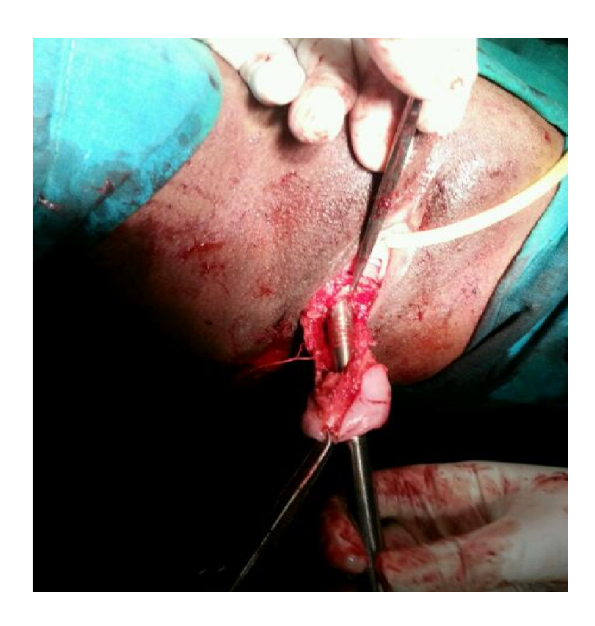
Figure D. Sleeve excision done with cervical dilator in situ