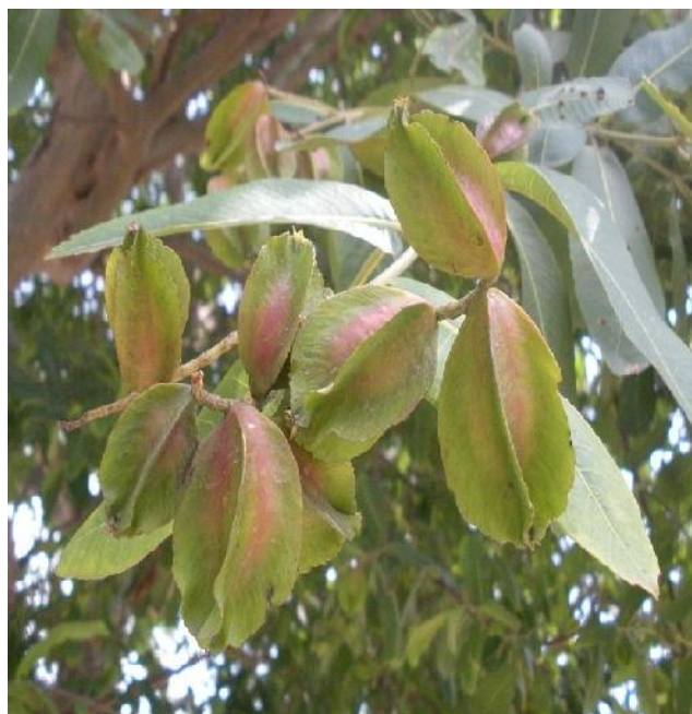
Terminalia arjuna Roxb.