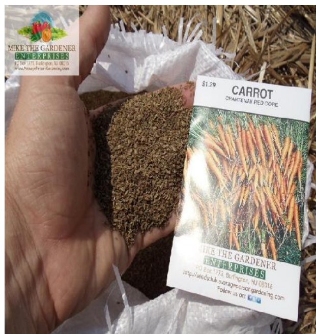
Daucus carota Linn.

The tribals and rural people depend exclusively on these plants for abortion. The experimental literature gives a scientific backbone for the use of plant species as abortifacients. Some act by their toxicity and some by their pharmacodynamic properties (Ajesh, 2012). But it is very difficult to identify the effectiveness of herbal abortifacients.