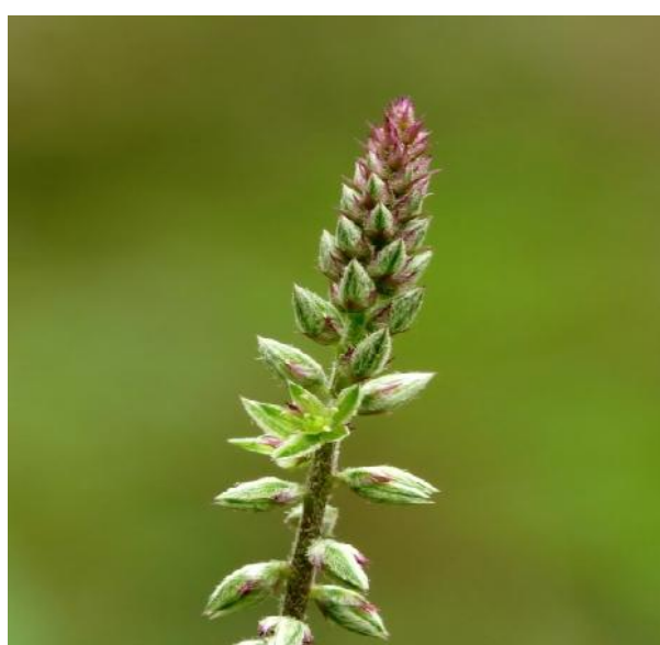
Achyranthus aspera L.

Mitra (2009) reported 22 abortifacient plants used by tribal people of West Bengal and their findings revealed that most of the drugs are prepared from the root portion of the plants. The present findings are also showed the same trend as nearly 50% of plants utilized for abortion containing active principles in their roots. Ethno-medicinal plants used by tribes of Kerala, India were also listed by Ajesh et al. (2012). Rajeshwari and Rani reported nearly 30 abortifacient plants from different areas of herbal wealth of India.