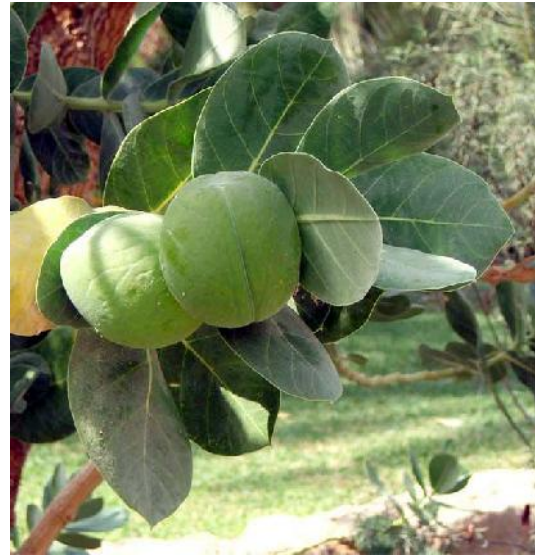
Calatropis procera (Ailton)