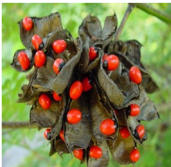
Abrus precatorius L.