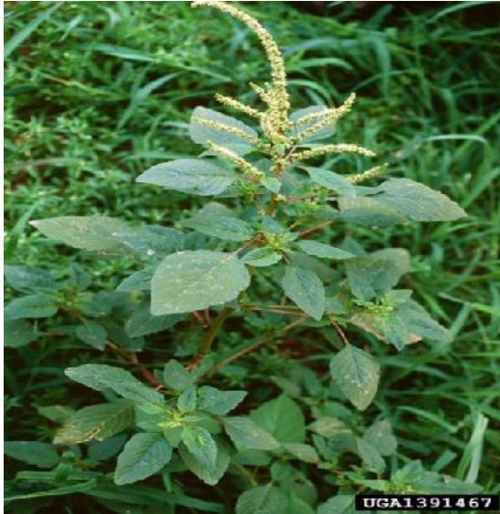
Amaranthus spinosus Linn.