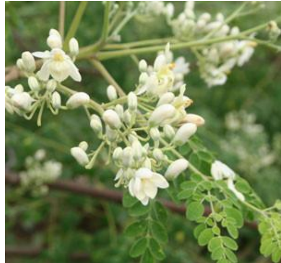
Moringa oleifera Linn.