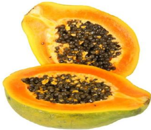
Carica papaya L.