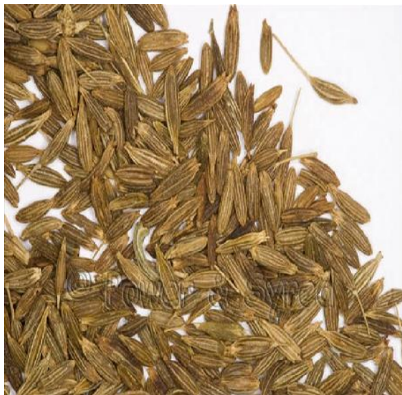
Cuminum cyaminum L.