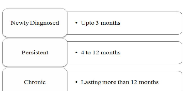
Table 1. Diagnosis of acute ITP

It also defines acute ITP as newly diagnosed if the diagnosis is upto 3 months, persistent when it is 4 to 12 months from diagnosis or chronic lasting for more than 12 months (Rodeghiero et al. , 2006). (Table 1)