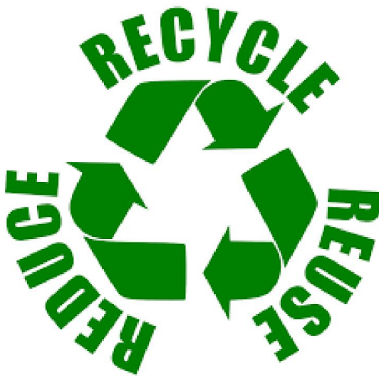
Figure 3. Green recycling and Disposal

Green recycling and Disposal: Green Recycling is a successful and effective environmental solution in waste management. In this process change waste materials into new products to prevent waste of potentially useful materials, reduce the consumption of fresh raw materials, reduce energy usage, reduce air pollution (from incineration) and water pollution by reducing the need for "conventional" waste disposal, and lower greenhouse gas emissions as compared to plastic production.