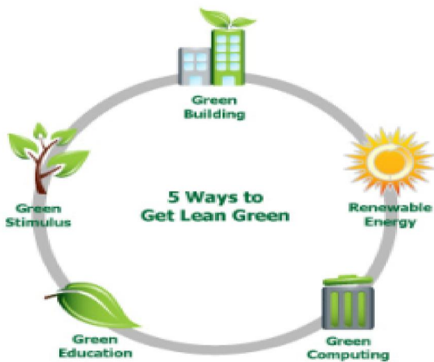
Figure 1. The green computing revolution cycle