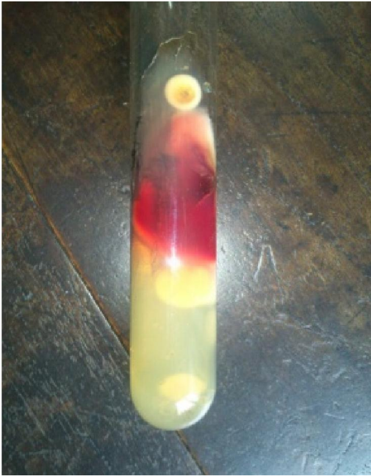
Culture tube of P.marneffii