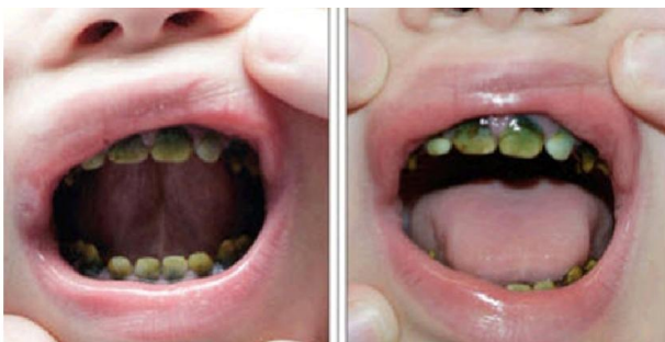
Fig 4. Green Teeth in a Child with Hyperbilirubinemia.

The elevated bilirubin in neonates due to certain diseases gets incorporated into developing teeth and causes yellow-green discoloration within the dental hard tissue (68-69). Bilirubin (haematoidin) is the yellow breakdown product of normal heme catabolism. Heme in hemoglobin is a prime component of red blood cells. The elevated level of bilirubin is indication of diseases. Normally, bilirubin is excreted in bile and urine, and is responsible for the background straw-yellow color of urine and the brown color of feces due to its end products urobilin and stercobilin. Hyperbilirubinemia causes accumulation of bilirubin pigment within the skin and mucous membranes that manifests as yellow pigmentation (70). In the newborn, jaundice is visible on the face at a serum bilirubin level of about 5 mg/dL; it progresses caudally as the level increases. When bilirubin levels are elevated for numerous days, bilirubin pigments gets deposited all over the body, including the teeth. Histological evaluation of green-stained deciduous teeth from patients with hyperbilirubinemia has confirmed the deposition of bilirubin. Intrinsic staining of primary teeth may vary in color from yellow to green. The removal of stain in the soft tissues takes place gradually. Nevertheless, in the hard dental tissues, the pigment becomes entangled due to deficient metabolic activity producing permanent staining (71) (Fig. 4).