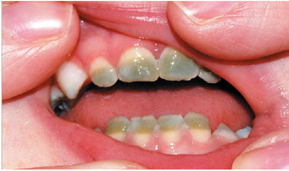
Fig 5. Chlorodontia due to sepsis. Green Teeth due to severe infection (Neonatal Sepsis).

pathogenic microorganisms into developing teeth (fig 5) within the dental hard tissue known as chlorodontia (75,76).