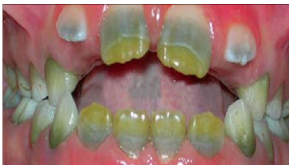
Fig 2. Green discoloration of teeth due to chromogenic bacteria. Green and orange stains are observed due to the presence of chromogenic bacteria

Green strains are attributed to fluorescent bacteria as well as fungi such as Penicillium and Aspergillus species (Fig 3). The organisms grow only in light and therefore cause staining on the maxillary surface of the anterior teeth. Fusayama et al. (45) depicted that discoloration precedes the bacterial penetration of demineralized dentine and it seems that the discoloration is caused by compounds diffusing ahead of the bacteria. However, Kleter et al. (46) have suggested that it may be due to the Maillard reaction or formation of melanin or lipofuscin if there exists no relationship between the discoloration and either pigmented bacteria or metal ions. This report was validated through the evidence that bacterial irritation to the pulp may cause tissue necrosis which in turn releases disintegrated by-products that penetrate the tubule and discolor the dentine. eg. Heme, a by-product of hemolysis discolors dentine by combining with pulp tissue to form iron sulfide (15). Fungal infections are infections caused mainly by a microorganism named fungus that occurs in both young and old with weakened immune systems. The possible factors that lead to infections are immunosuppressant, HIV/AIDS, steroids and cancer chemotherapy. Due to surplus availability of glucose in diabetics they are more prone to the fungal infections as the elevated blood sugar provides nutrition for fungal overgrowth (47).