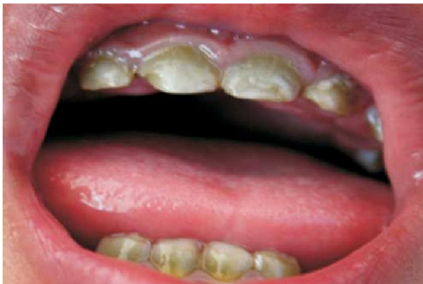
Fig 1. Green-to-black stained deciduous teeth. Green pigmentation of teeth as a consequence of metals, drugs, microorganism or diseases

Green teeth are an uncommon condition that is associated with bilirubin deposits in dental hard tissues, decomposed hemoglobin (15) and inorganic elements like calcium, sodium, magnesium, potassium, silicon, phosphorous and other elements in small amounts. Discoloration can also occur due to incomplete removal of obstructing material and sealer remnants in the pulp chamber, containing metallic components (16, 17) (fig 1). Green stain is found mainly on the cervical surface of the anterior teeth of children and is a remnant of Nasmyth's membrane and accumulated food debris (18).