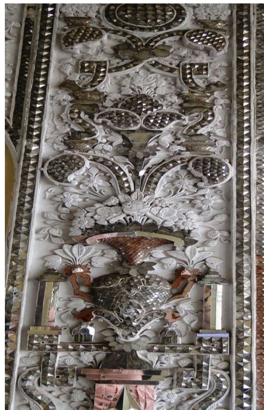
Fig. 7. Stucco design sample and mirror working in the Mirror Hall

These motifs are implemented in rectangular or oval frameworks in which arabesque and spiral motifs emanate from the vase below and extend to the top in a symmetrical form. This style is more influenced by the European designs (Image 8).