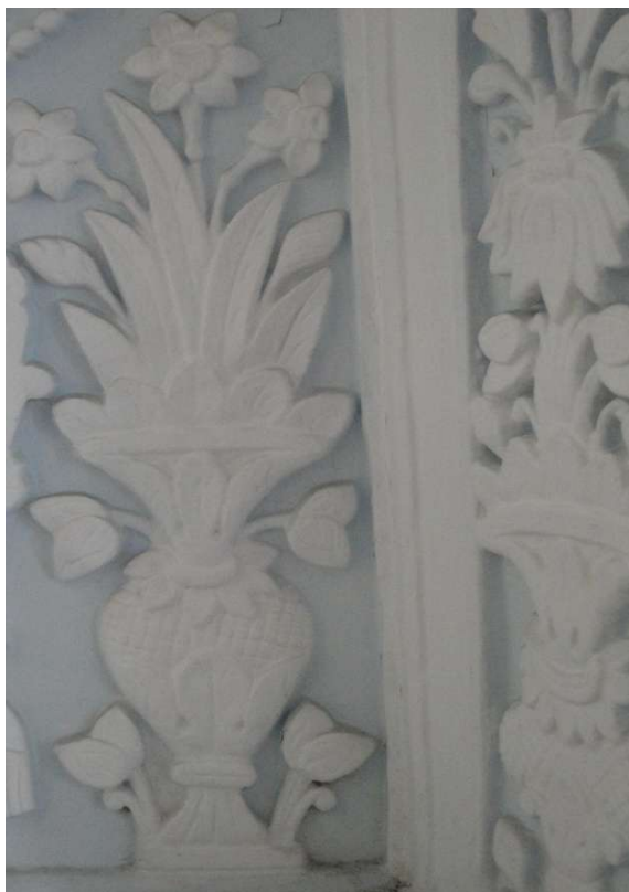
Fig. 6. Stucco design sample from one of the Abrishami rooms

The patterns of vase and flowers are of the European styles and in these samples the vase role is especial as the branches, leaves, and flowers are dangling out of the vase (Image 6 & 7).