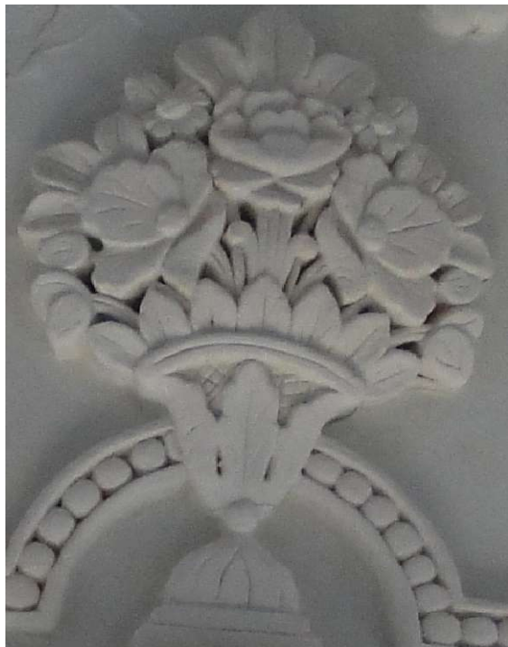
Fig. 5. Stucco design sample from one of the Abrishami rooms

raised forms which is one of the influences adopted from the European styles during the Qajar period (Image 5).