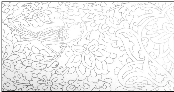
Fig. 1 & 2. Stucco design of Safavid Period

With regard to the use of Mirror work for decoration, based on the historical evidences, it was used for the first time during the reign of Shah Tahmasb in Safavid period in a forum in the city of Qazvin and its use continued in other structures like Chehel Sotoun Palace of Isfahan (Mishmast Nahi & Abed Isfahani, 1386). Mirror work in the Qajar period was also used in palaces, aristocratic houses, and shrines. Geometric and plant motifs were mainly used in mirror works of that era. Similarly, in the Mirror hall of the Silk House, the use of mirror works is seen along with stucco.