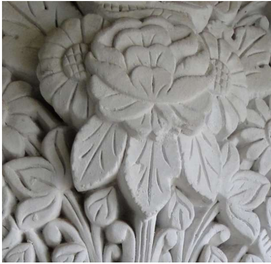
Fig. 9. Stucco design sample from one of the Abrishami rooms