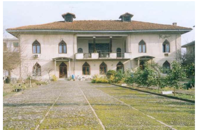
Fig. 4. Abrishami House