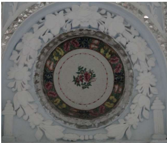
Fig. 10&11. Stucco design sample with the medallion in Chinese Hall

One other feature that needs to be mentioned is the use of Medallion in stuccos which is one of the European art traits. Also, the prevalence of stuccos with dense and fine plant motifs in this period was because of the spread of fabrics with the same motifs in Europe (Image 10 & 11). A stucco with European motifs which show a bunch of grapes with plant designs (Image 12).