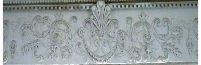
Fig. 12. Stucco design sample from one of the Abrishami rooms

One other feature that needs to be mentioned is the use of Medallion in stuccos which is one of the European art traits. Also, the prevalence of stuccos with dense and fine plant motifs in this period was because of the spread of fabrics with the same motifs in Europe (Image 10 & 11). A stucco with European motifs which show a bunch of grapes with plant designs (Image 12).