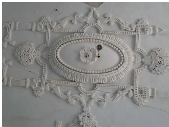
Fig. 8. Stucco design sample from one of the Abrishami rooms

These motifs are implemented in rectangular or oval frameworks in which arabesque and spiral motifs emanate from the vase below and extend to the top in a symmetrical form. This style is more influenced by the European designs (Image 8).