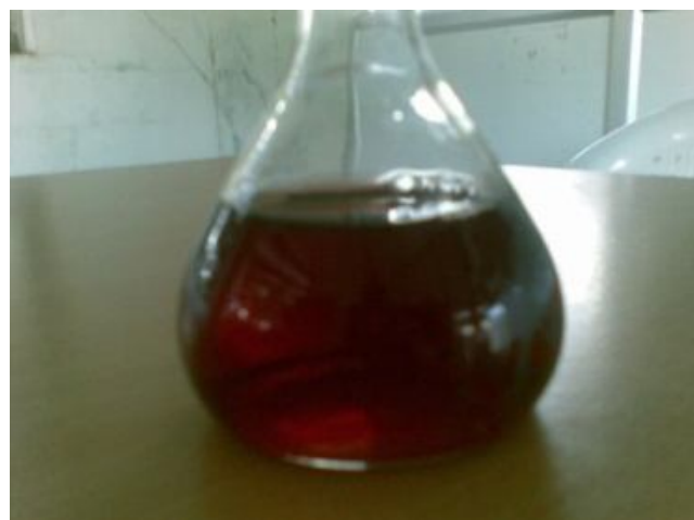
Figure 3. Aqueous extract from barks of Odina wodier

The barks of Odina wodier were found to discharge colour in hot water very easily. Increasing the quantity of barks 5 g to 20 g per 100 mL water boiled for 1 hour is accompanied with the increase in colour strength and depth in colour [12]. It was observed that, colour of the dye extract was dark red colour.