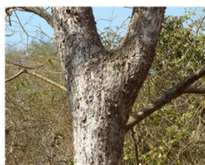
Figure 1. Odina wodier tree

The barks of Odina wodier were collected from saliamangalam village, thanjavur district (Fig.2).