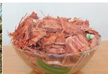
Figure 2. Barks of Odina wodier

Substrates: Degummed silk fabric was used for dyeing