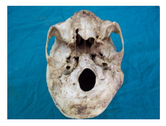
Fig. 2. Arrow showing pear shaped foramen ovale

ovale is required to indicate the need for open surgical, radio surgical, and radiotherepeutic treatment<sup>4</sup>. Knowing the anatomical variations of foramen ovale is important for surgical treatment of trigeminal neuralgia. So any variation in shape, formation or location is of great clinical significance. Present study showed maximum number of foramen to be oval shaped about 68% followed by slit like about15%.Round, almond and pear shaped were 5%, 5%, 7% respectively. Similar was the findings in a study conducted in Japan, majority of foramen was oval shaped and they were irregular compared to other foramen of human sphenoid bone <sup>5</sup>. Present study showed the mean length of foramen ovale was 7.85±1.32 mm on right side and 7.3±1.27mm on left side. There was no significant difference between 2 sides (p>0.05). One of the study conducted in Japan reported the length of foramen ovale was 3.8mm,7.2mm in newborn and in adults with maximum and minimum length being 7.48mm and 4.17mmin adults 5.