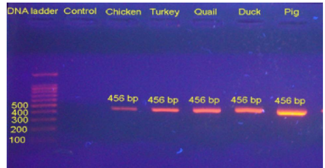
Fig. 1. Polymerase chain reaction (PCR) amplification of mitochondrial 12S r RNA gene from pig and some avian species. Amplicons were analyzed by 1% agarose gel electrophoresis

turkey, quail, duck and pig ( Figure 1). Six DNA samples from each species were extracted and subjected to PCR amplification for use in the RFLP trials. PCR products were successfully amplified to the expected 456 bp fragment within 12S r RNA gene. It is more efficient to detect species-specific DNA using mitochondrial DNA than genomic DNA (Cheng et al. , 2003), because there are approximately 104 copies of mitochondrial DNA available per cell compared to only one copy of genomic DNA.